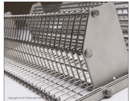
Solid stainless steel flight