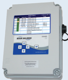
DS405 Lubrication Monitor