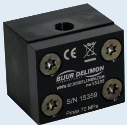
Lube Point Monitor