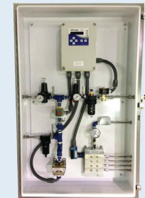
Gear Spray System