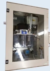
SureFire Air/Oil System