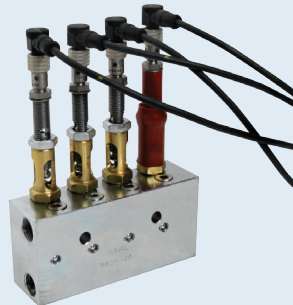
DD-DM Indicator Pin Monitor